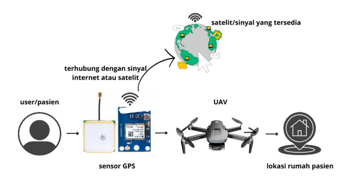
Figure 1. System architecture.

Based on who developed an IoT-based diabetes patient monitoring system using MCU Nodes, the system architecture is as below (Figure 1).